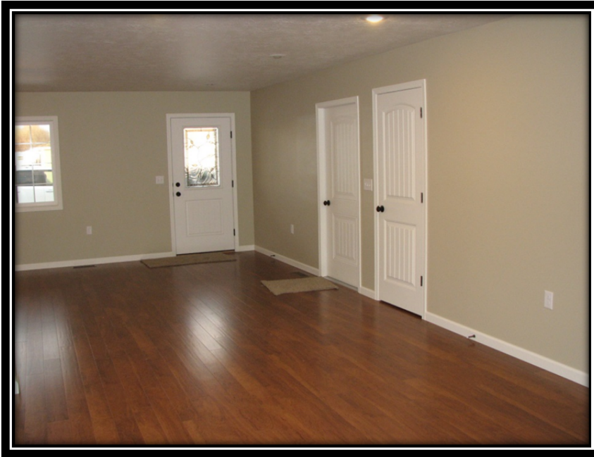
Sample Great Room